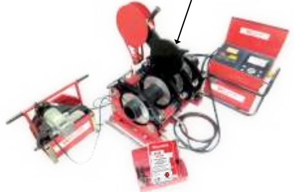
Auto ejecting heating plate

Product CNC BUTT FUSION WELDING MACHINE Models WCNC160, WCNC200, WCNC250, WCNC315, WCNC355, WCNC450, WCNC500, WCNC630, WCNC800, WCNC1000, WCNC1200, WCNC1600 Description Highly innovative fourth generation CNC butt fusion welding machine with inbuilt on-site printer suitable for all SDR & pressure stages for PE, PP, PB & PVDF pipes and fittings up to 1600 mm & bigger sizes on request.