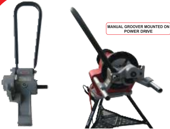
MANUAL GROOVER MOUNTED ON POWER DRIVE