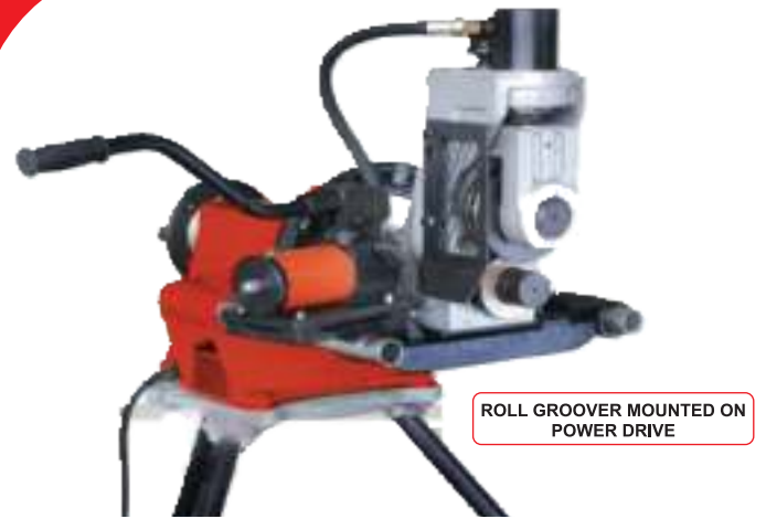
ROLL GROOVER MOUNTED ON POWER DRIVE

Description Ideally used for installation of sprinkler systems & quick connection of steel pipes. Machine to be mounted on Power Drive or FILETAGE series for performing a groove suitable for pipe sizes form 2" – 6".